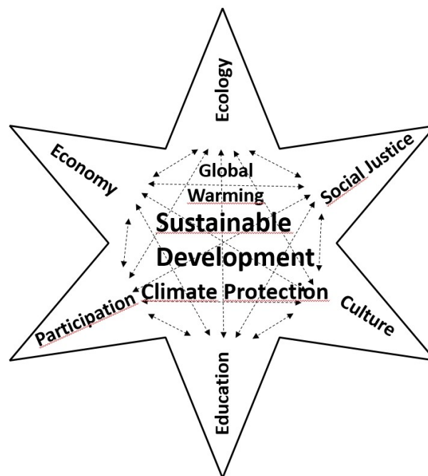
Fig. 1: G. Becker: Six-dimensional model of SD and climate protection (six-pointed star).

More than twenty years ago I defined a model of six dimensions, namely, ecology, economy, social justice, participation, culture and education 9 within the discourse on the term Sustainable Development. Thus, in terms of content, the model is in line with the idea of UNESCO as an international organization for ‘education, science, culture and communication’ on basis of democracy, development and human dignity. Naturally, this model holds true for all subjects of Sustainable Development also for global Climate Change and global Climate Protection 10